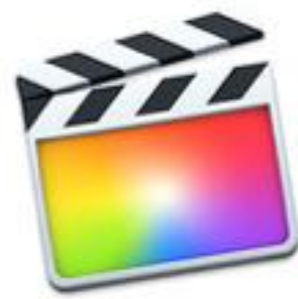
Final Cut Pro X